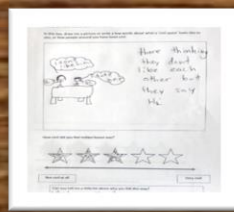
Examples of student feedback on safe, brave, and civil spaces