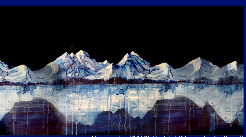
Alexopoulos (2013) Untitled (Mountains for Portal) http://www.yorgo.org/artworks/06_untitledMts

The combination across multiscreens is mesmeric. His work inspires me to work with the technique beyond this project on my own arsenal of images and photographs. His use of sound to amplify the visual effect is not noted in any of the commentaries I found but is also surely significant.