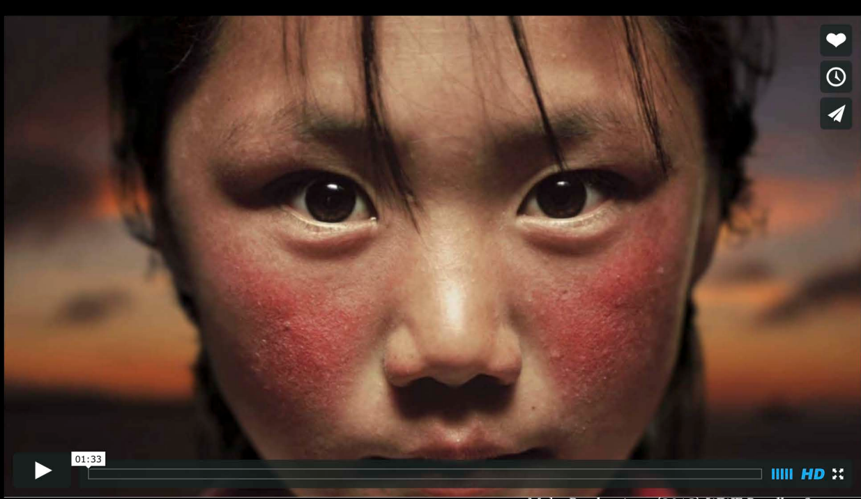
Make Productions (2013) WWF Parallax Sequence https://vimeo.com/50672419

https://uk.linkedin.com/pub/joe-fellows/a/741/171