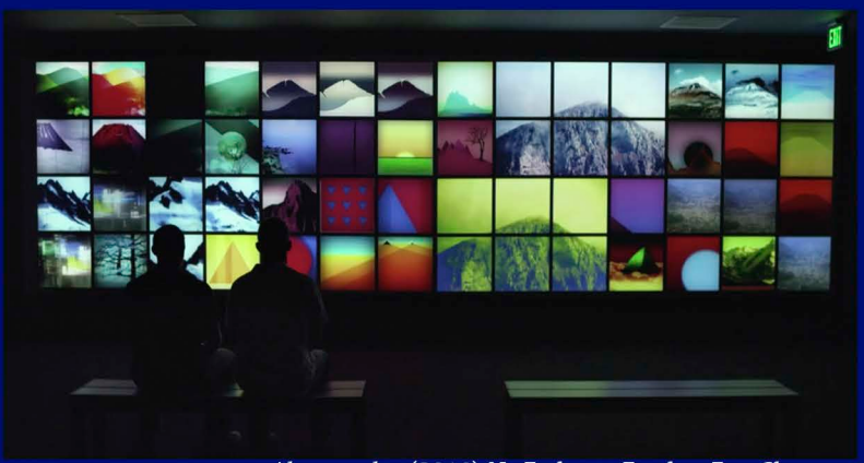
Alexopoulos (2010) No Feeling is Final: in Five Chapters, http://www.yorgo.org/videos/nfifv